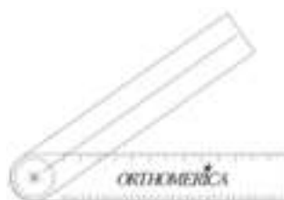
Newport® Goniometer 3876

For extremely short or extremely tall patients, contact customer service for alternate bar length.